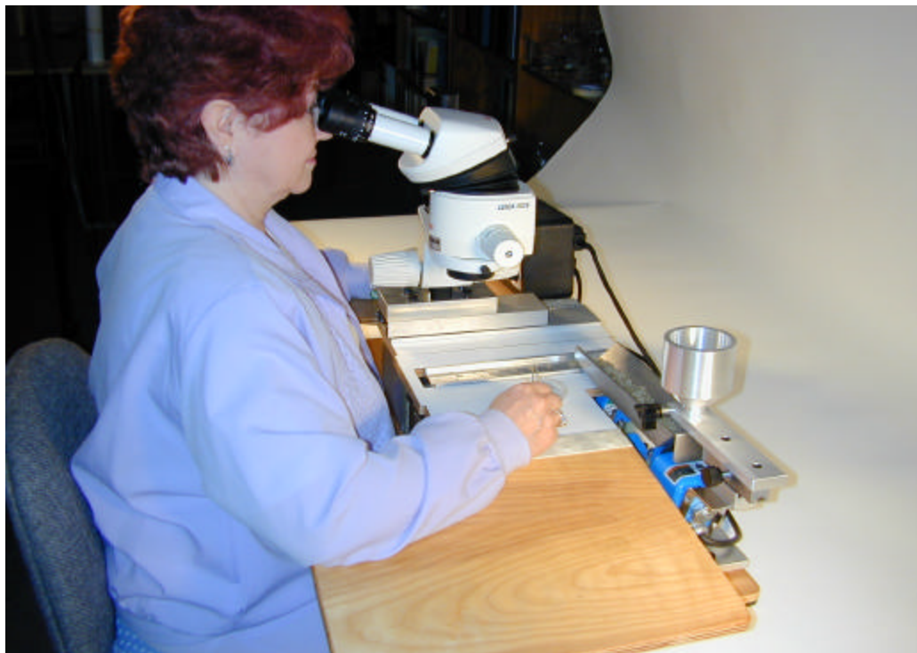
Fig. 2. The Ergovision Inspection Station is designed to reduce analyst's fatigue and discomfort.